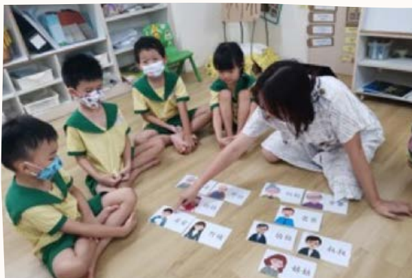
*Chinese Version available in the Appendix